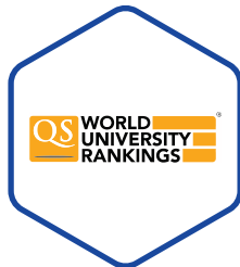
QS-Advanced E-Lead Certificate